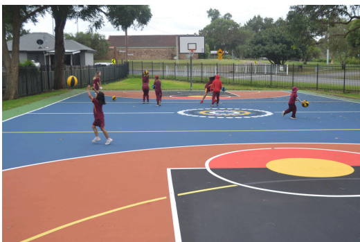
Netball / Basketball