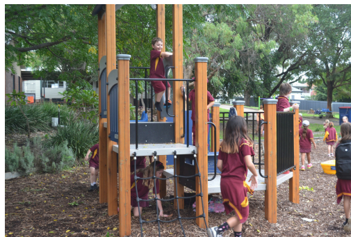
Climb and slide