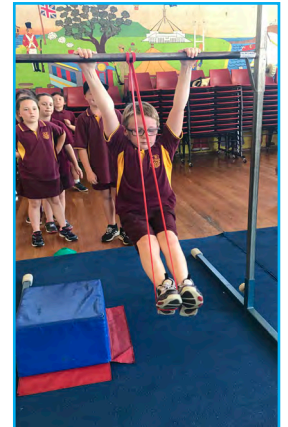
Stage 2 and 3 having a blast at Gymnastics Week 2

2A have completed some amazing artworks of parrots and Miss Ashely is so proud that she wanted to share them with you.